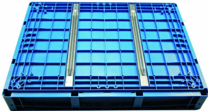
Picture 1: BITO's XL 800x600 mm: Container base with integrated steel plates before the base cover is welded on.